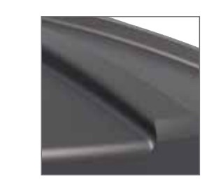
Ribs in the roof give added strength