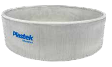
1800 Litres 2290mm x 630mm (Dia x H) 25mm inlet, 50mm outlet

Plastek also have a full range of concrete troughs available from 240 Litre to 1800 Litre. Limited distribution... call now for a price!