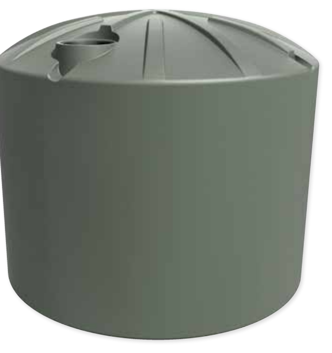
27250L (6000 Gallons) Round Smooth 3650mm x 3100mm (Dia. x H), Inlet Height: 2850mm, Colour: Rivergum