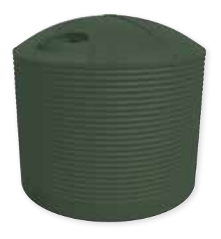
9000L (2000 Gallons) Round Corru 2540mm x 2200 mm (Dia x H) Inlet Height: 1950mm Colour: Off White