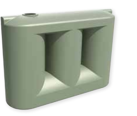
2100L (462 Gallons) Slimline Smooth 2420mm x 760mm x 1650mm (LWH) Inlet Height: 1650mm, Colour: Mist Green